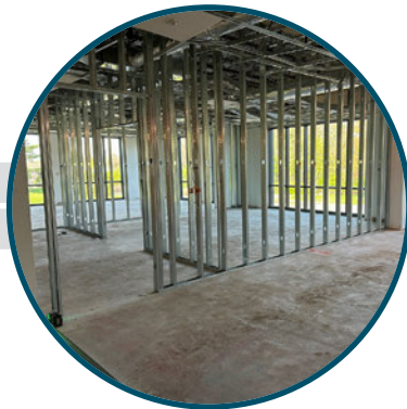
WINTER & SPRING 2025: Groundbreaking & Renovations Underway