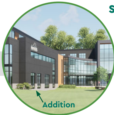
FALL 2025–SPRING 2026 (TENTATIVE): Construction of Addition