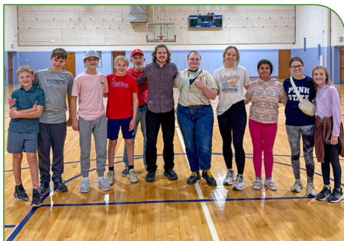
St. Luke Lutheran Church Youth Group Members