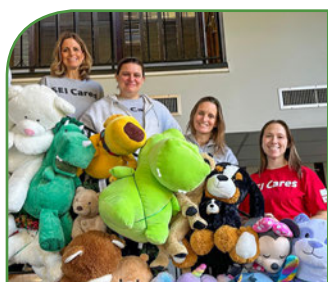
Friends from SEI