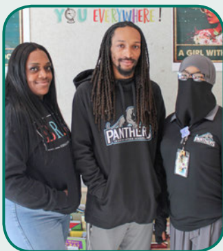
Three Recent Graduates

We are proud to congratulate and celebrate five participants in our Teacher Apprentice Program (TAP) who graduated with their bachelor's degrees in December from Arcadia University, and one participant who graduated last May from Cabrini University!